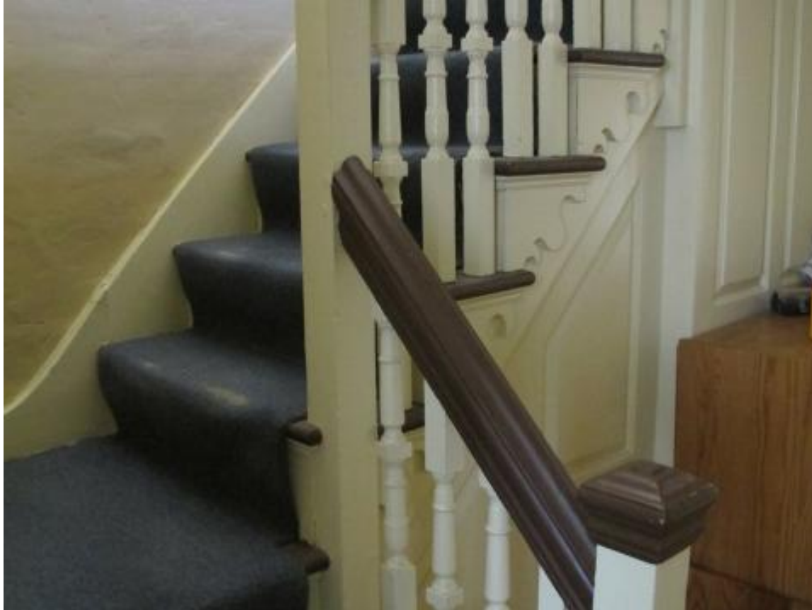
Detail of older stair