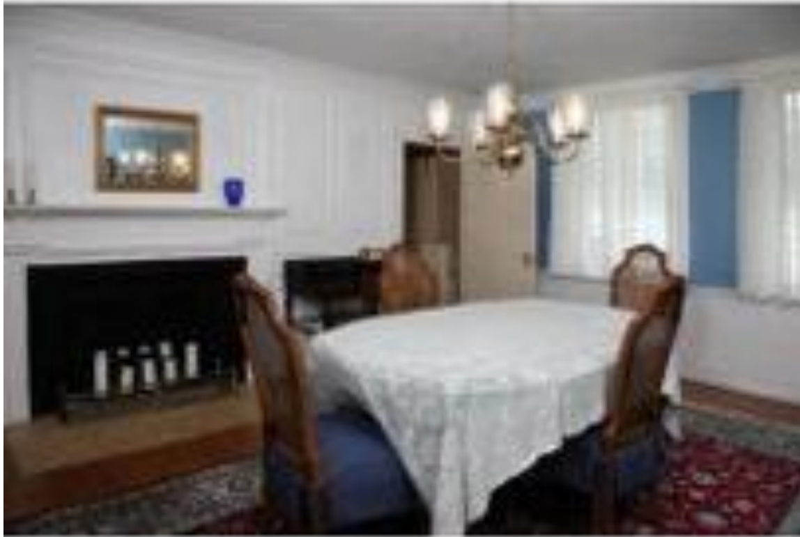
Dining room fireplace and wall paneling