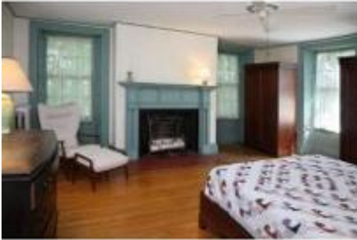
Interior detail remains intact