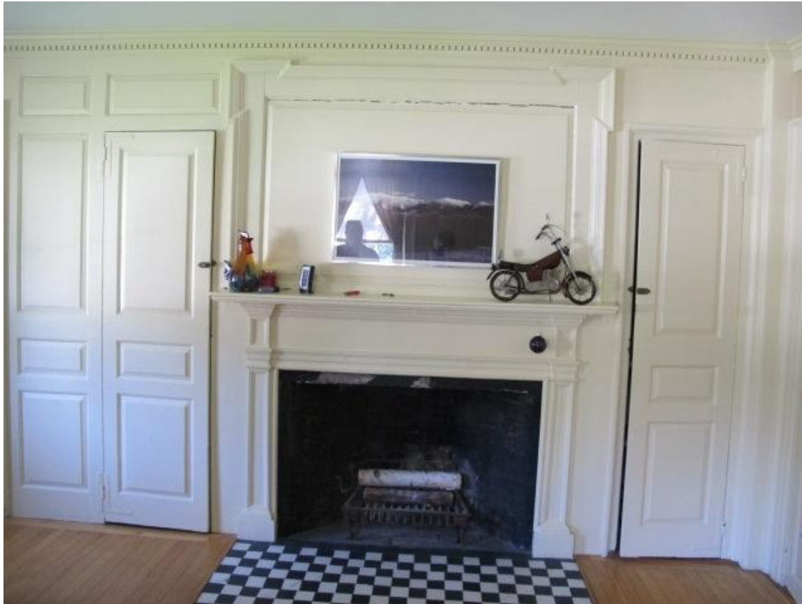
Fine fireplace and wall detail